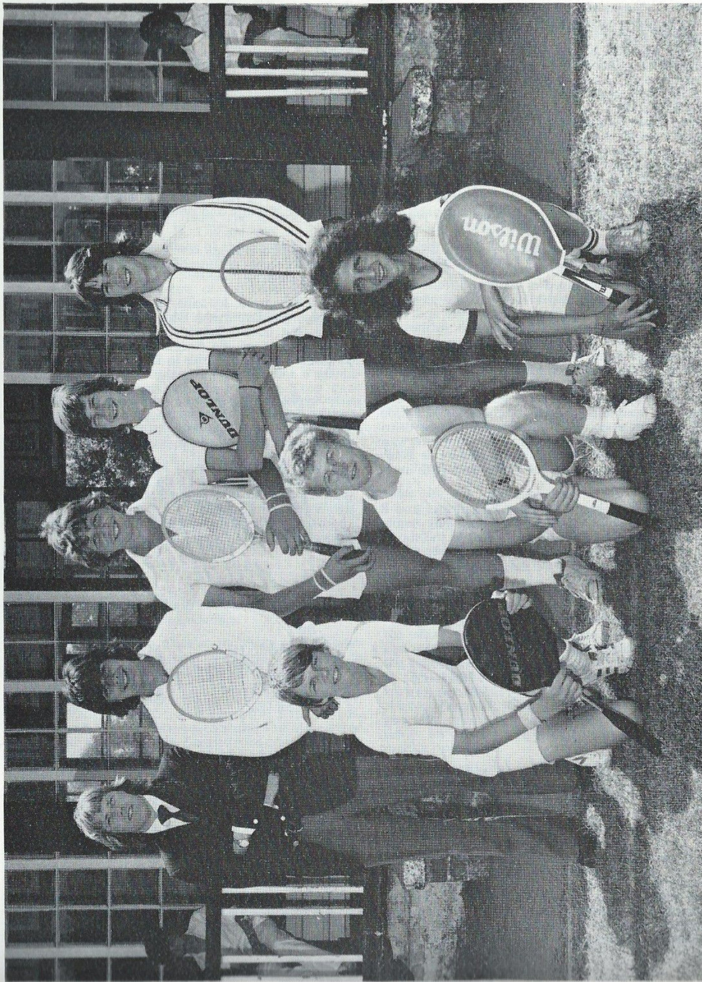
TENNIS 1st TEAM