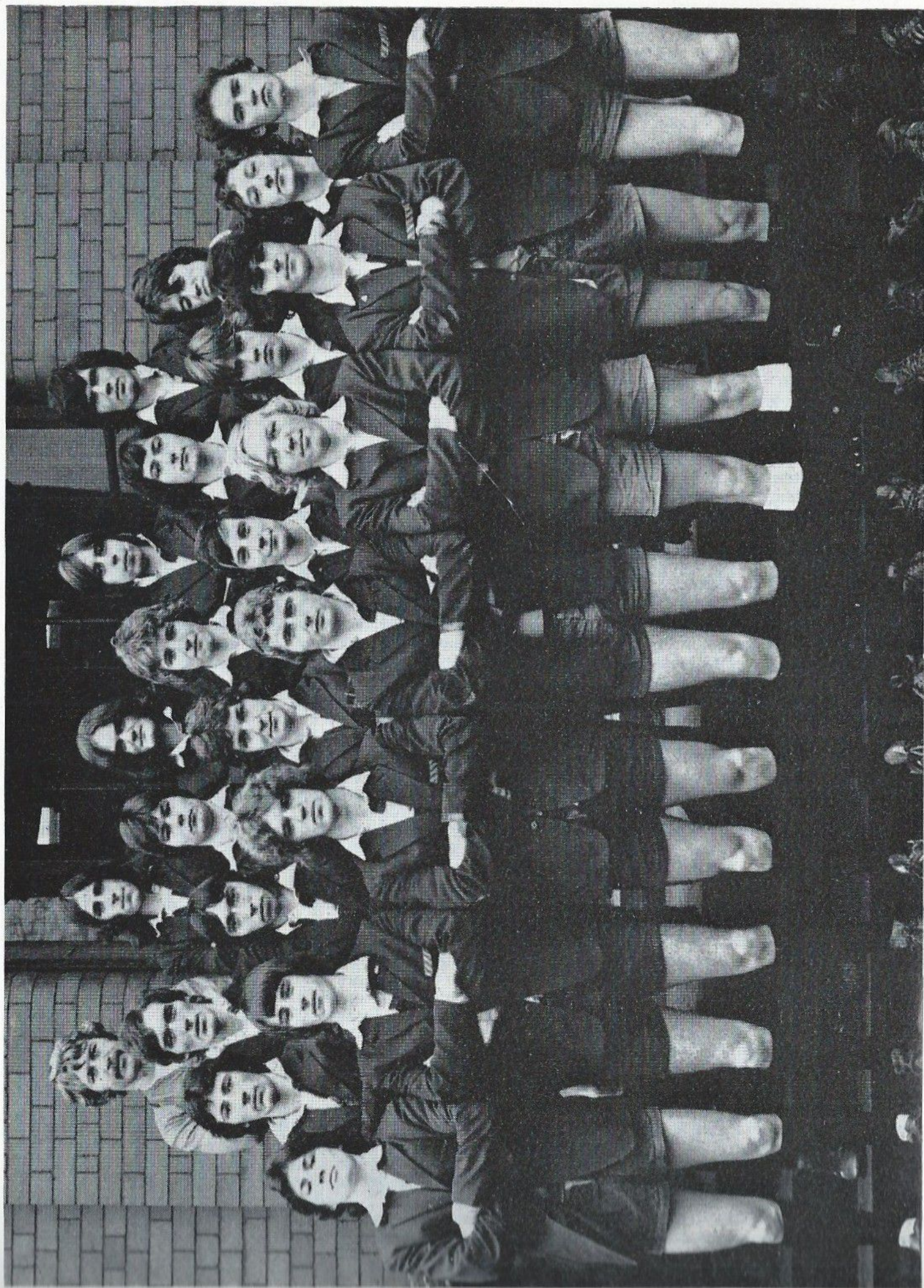
RUGBY 1st XV